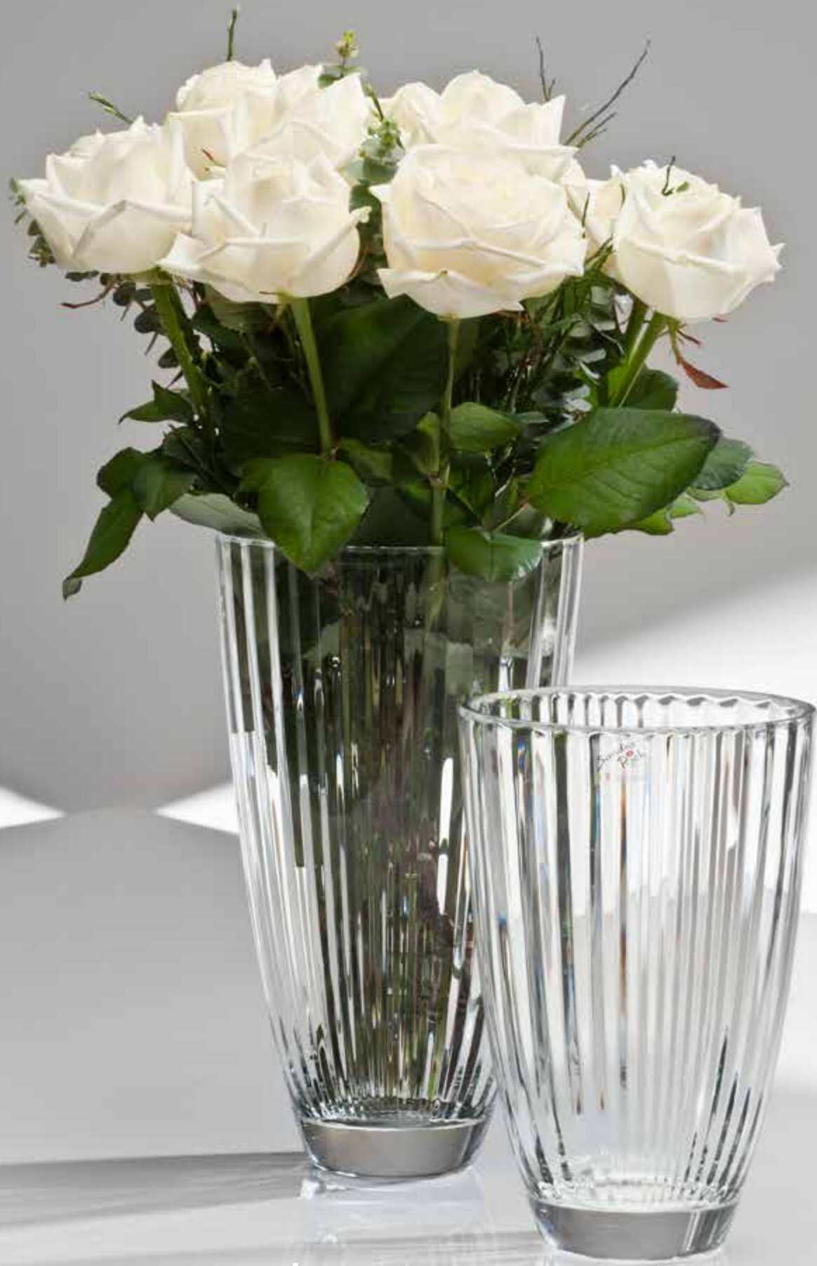
ELEGANCE - glass