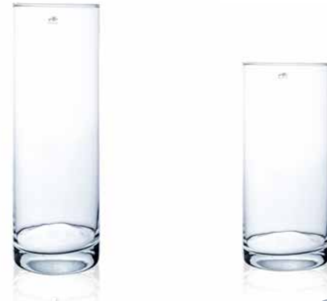
CYLI hot cut - glass