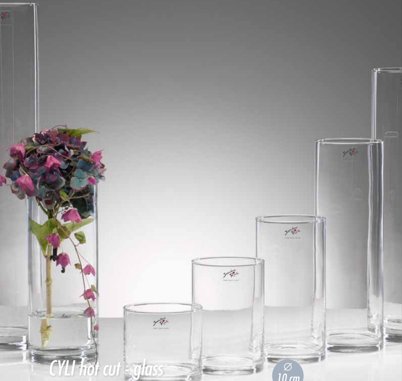
CYLI hot cut - glass