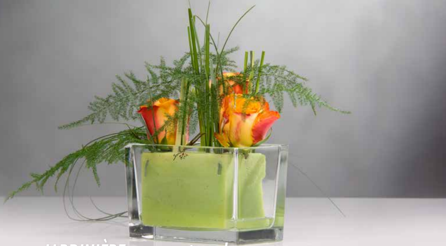
JARDINIÈRE automatic - glass