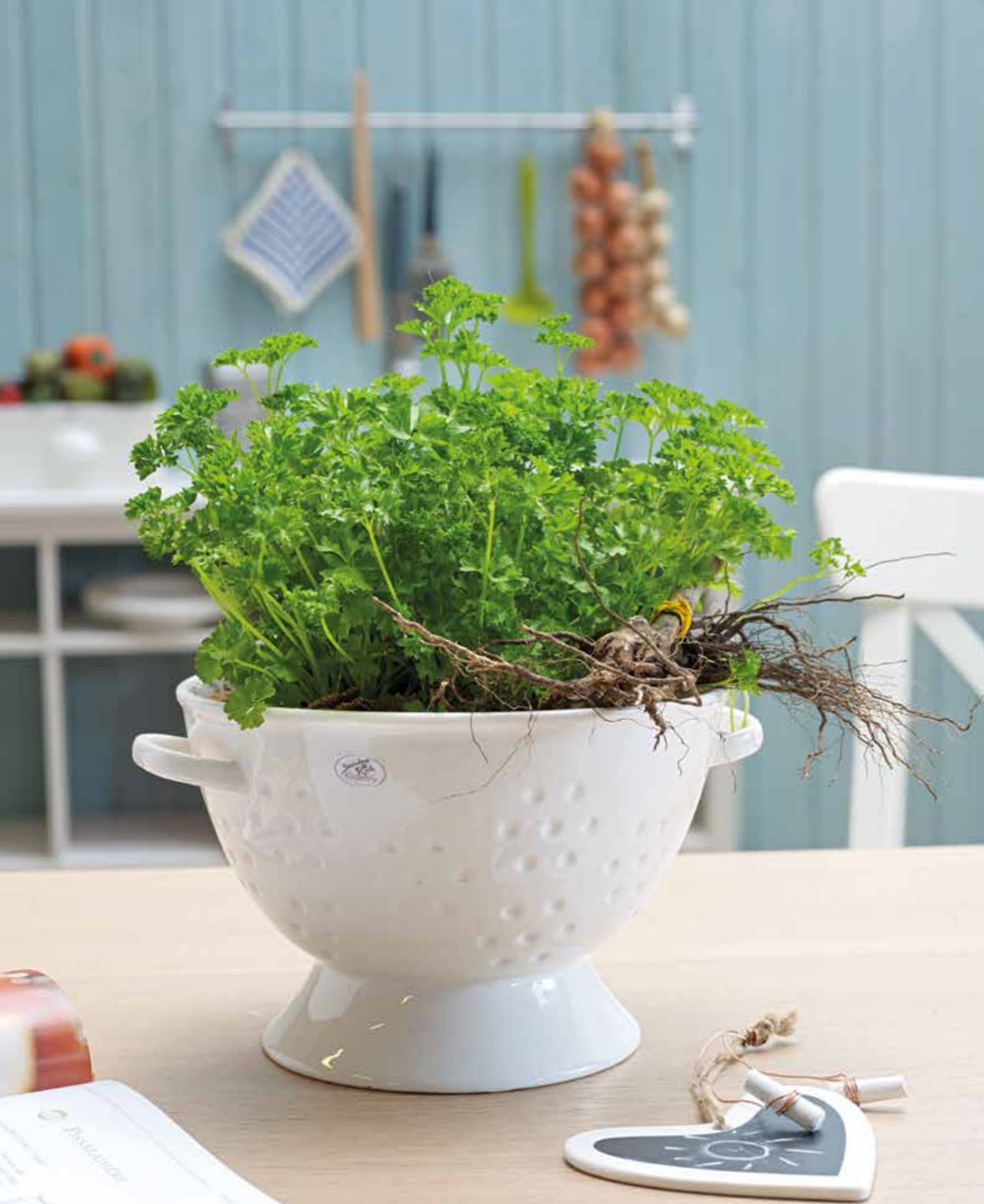
Sandra's SECRET GARDEN - porcelain