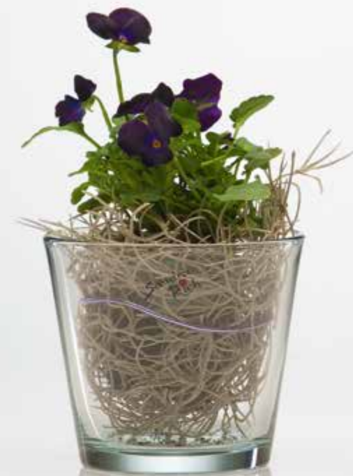
CONI automatic - glass