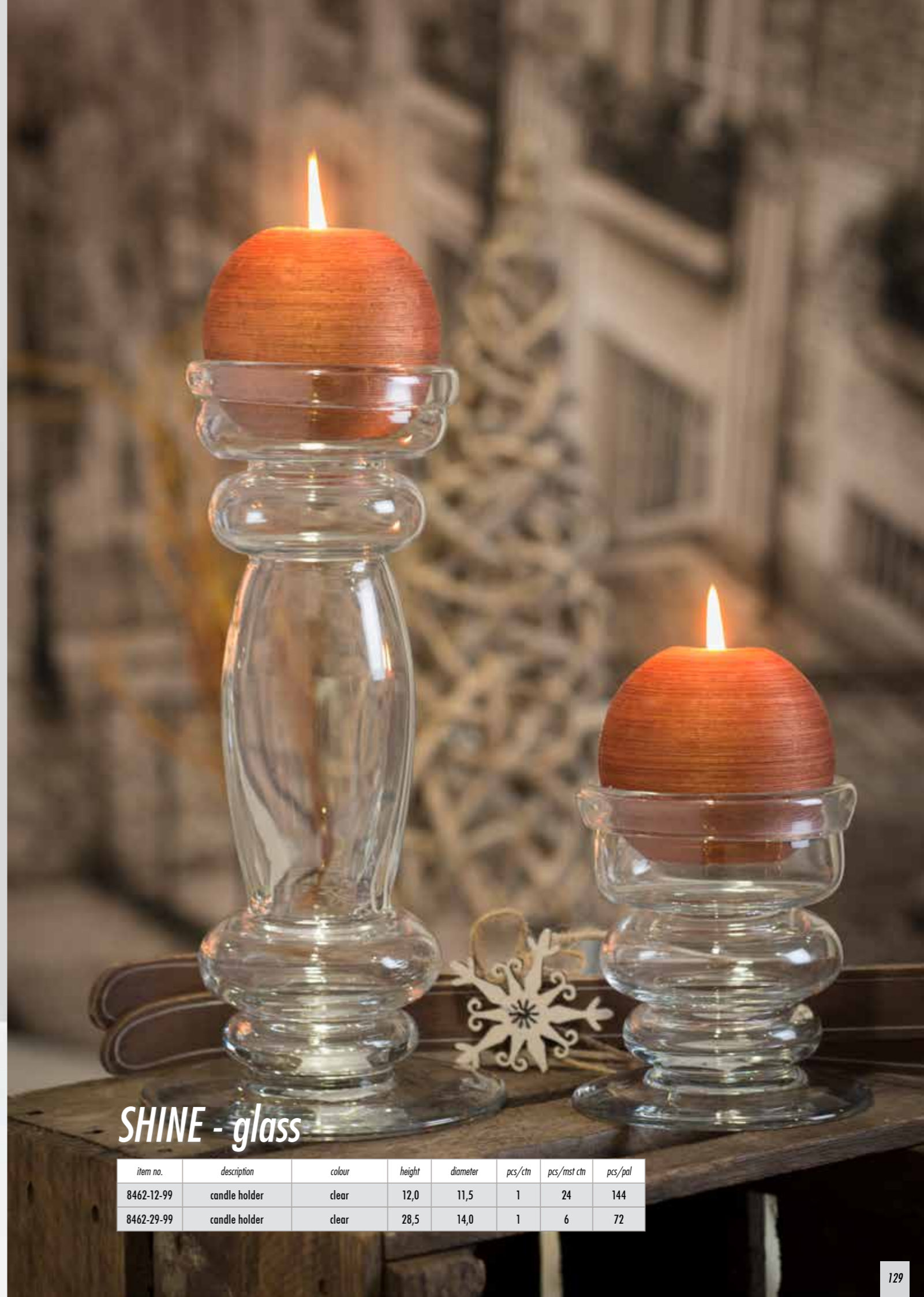
SHINE - glass