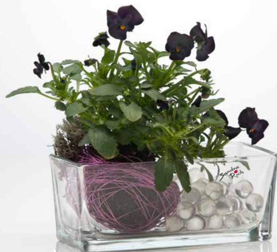
JARDINIÈRE - glass