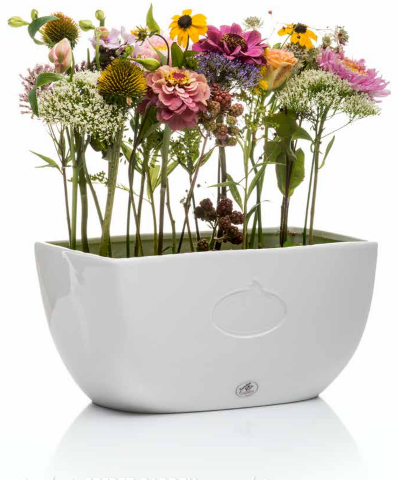
Sandra's SECRET GARDEN - porcelain