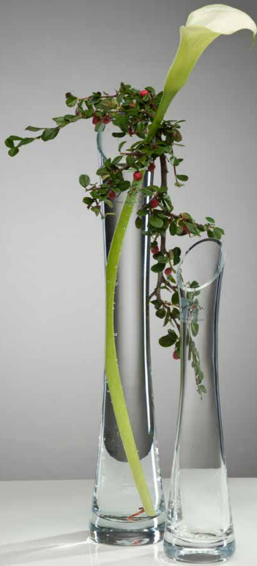
SOLO - DIAGO diagonal cold cut - glass