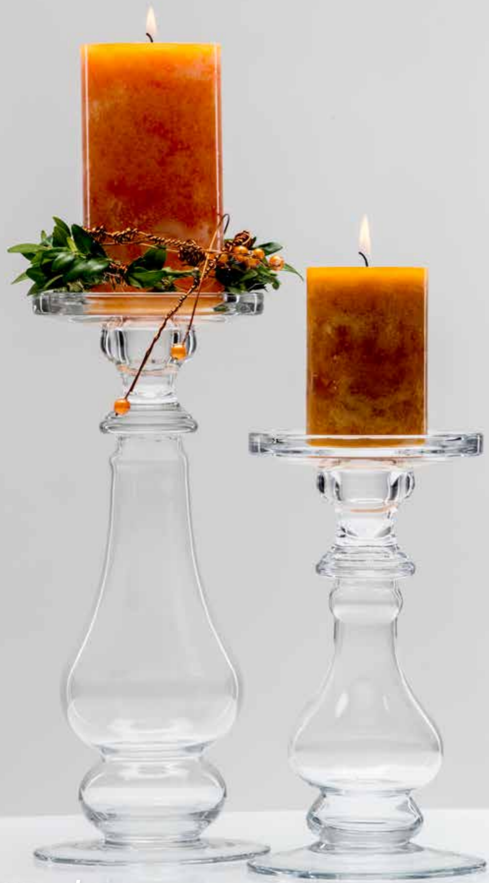
SHINE - glass