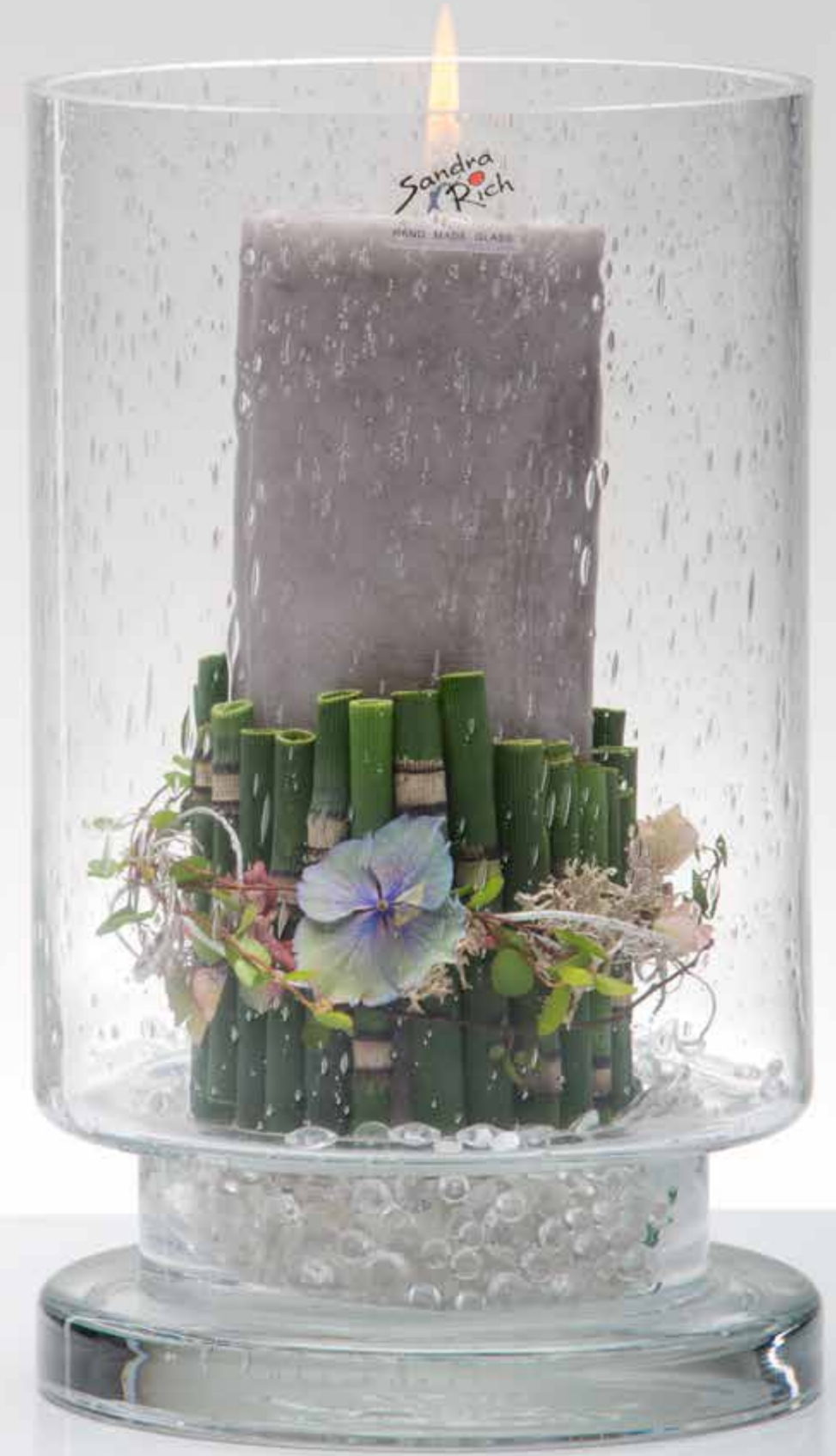
HURRICANE - glass