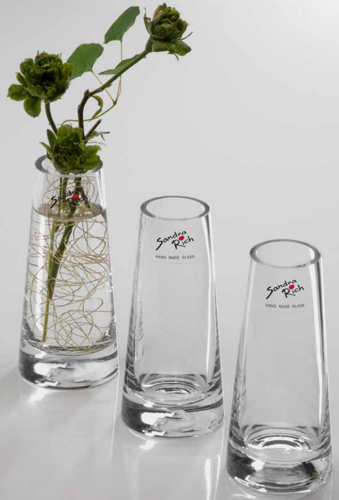
SOLO - MINI cold cut - glass