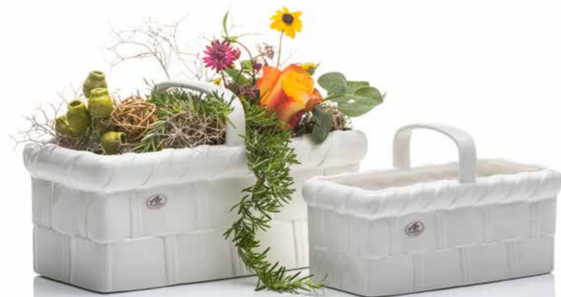
Sandra's SECRET GARDEN - porcelain