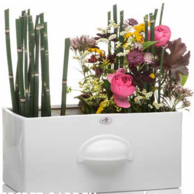
Sandra's SECRET GARDEN - porcelain