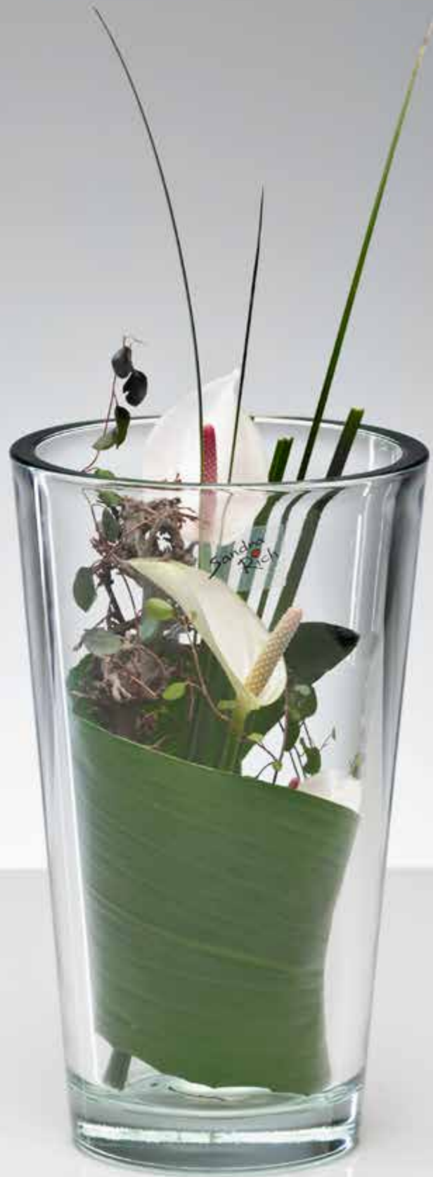
HEAVY - glass