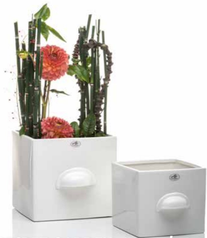
Sandra's SECRET GARDEN - porcelain