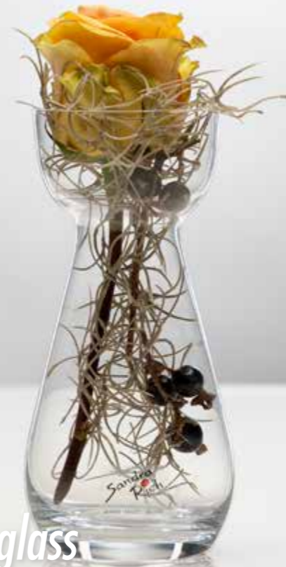
HYACINTH hot cut - glass