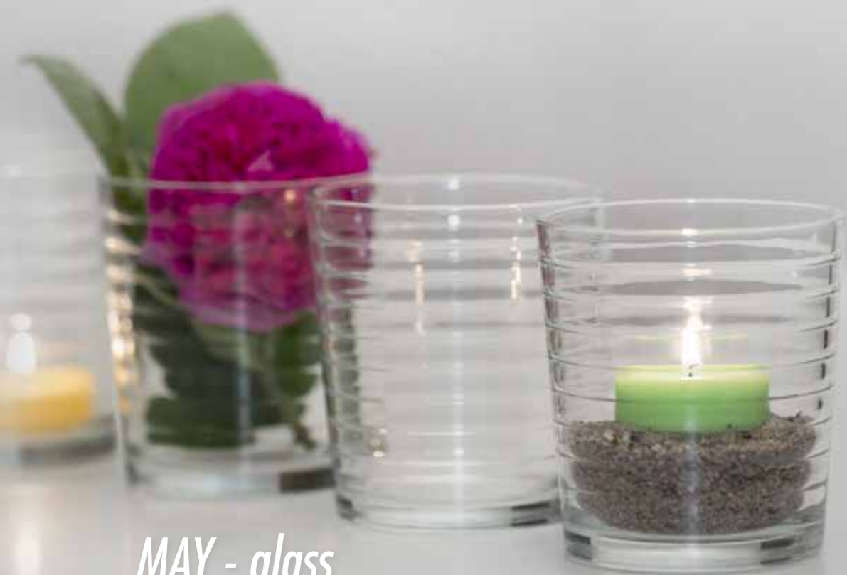
MAY - glass