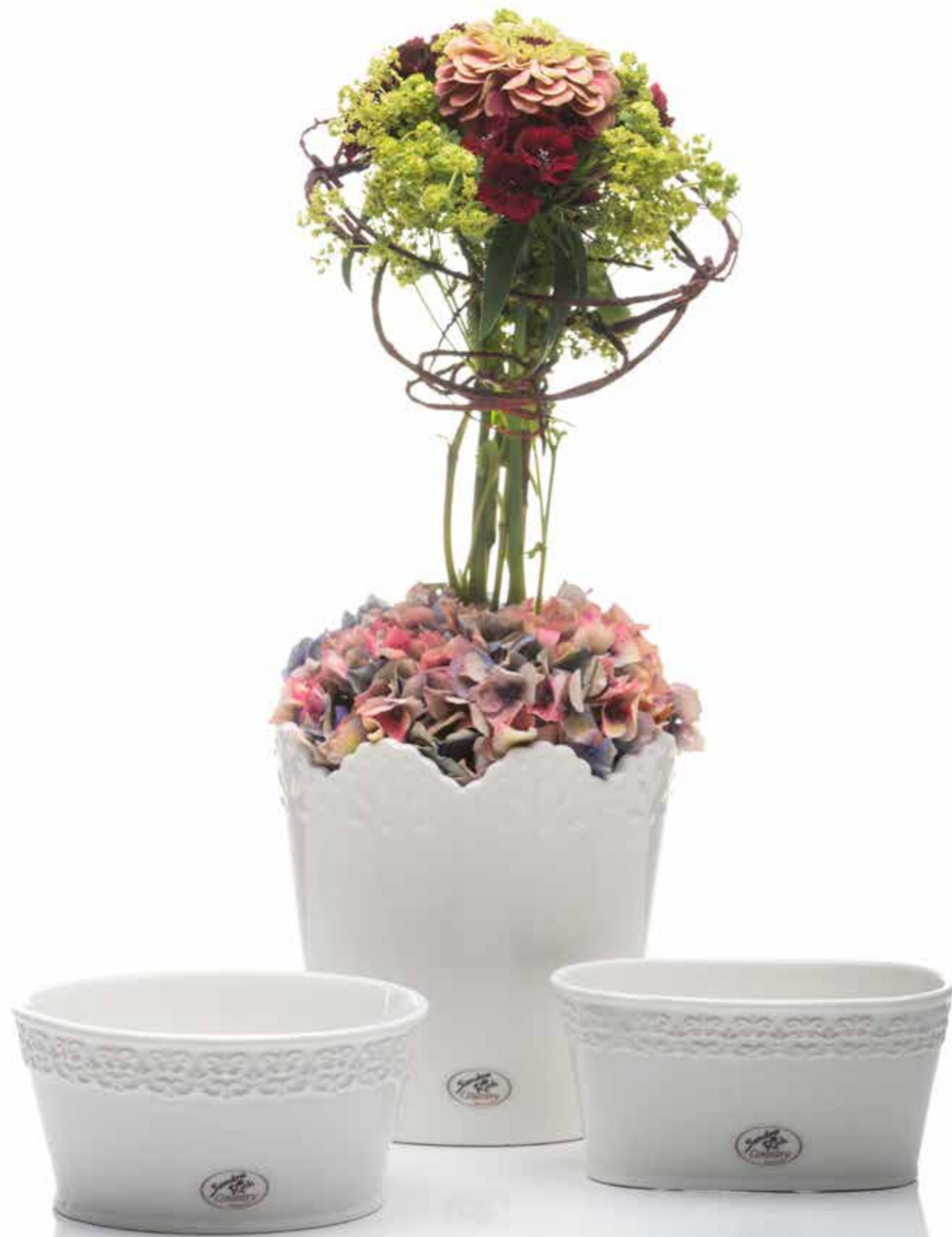
Sandra's SECRET GARDEN - porcelain