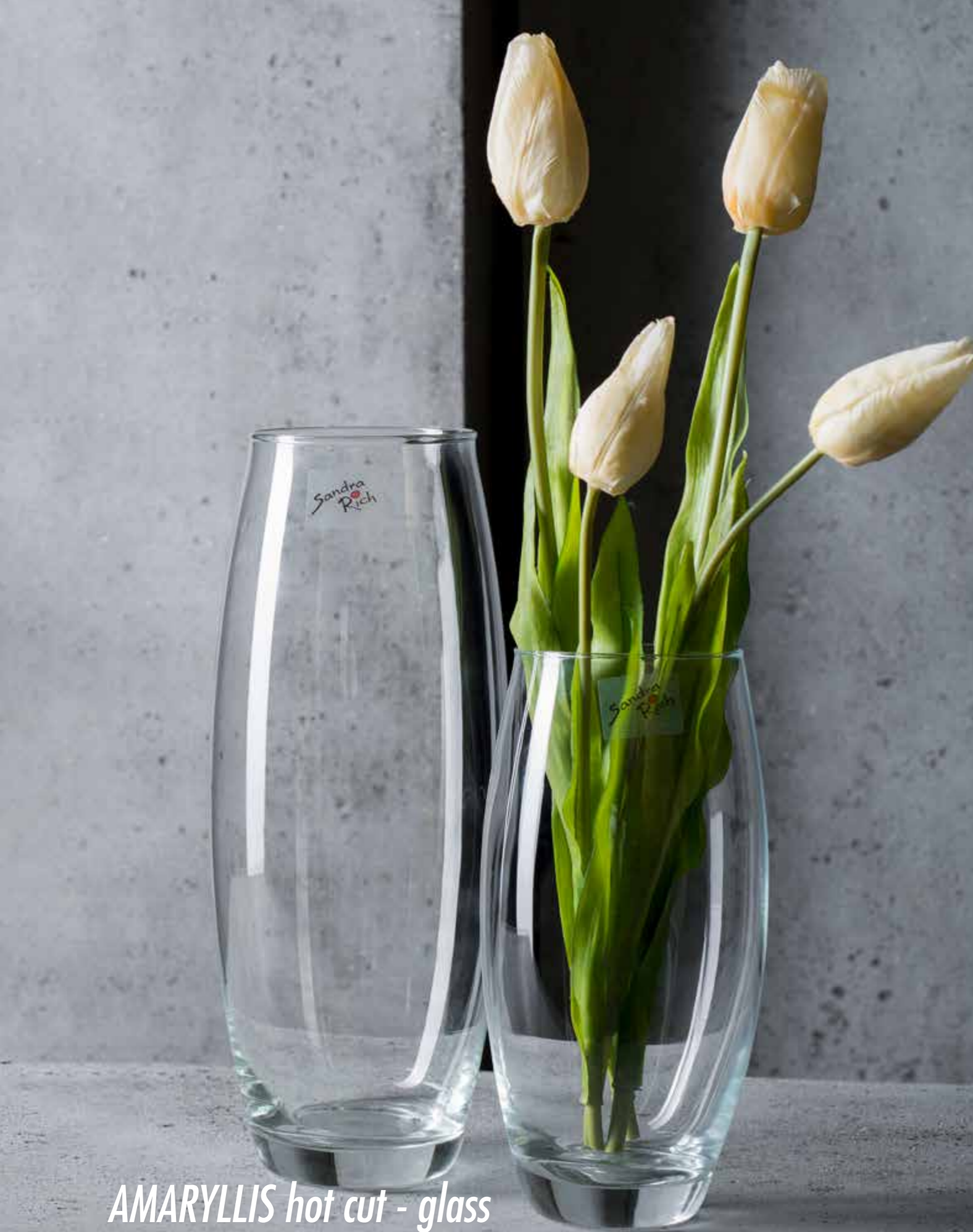
AMARYLLIS hot cut - glass