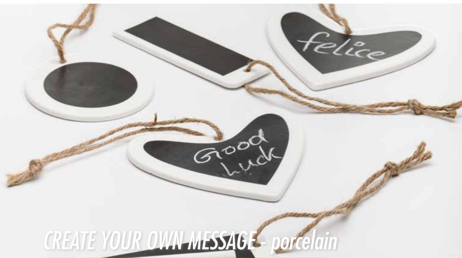
CREATE YOUR OWN MESSAGE - porcelain