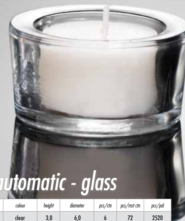
HEAVY full automatic - glass