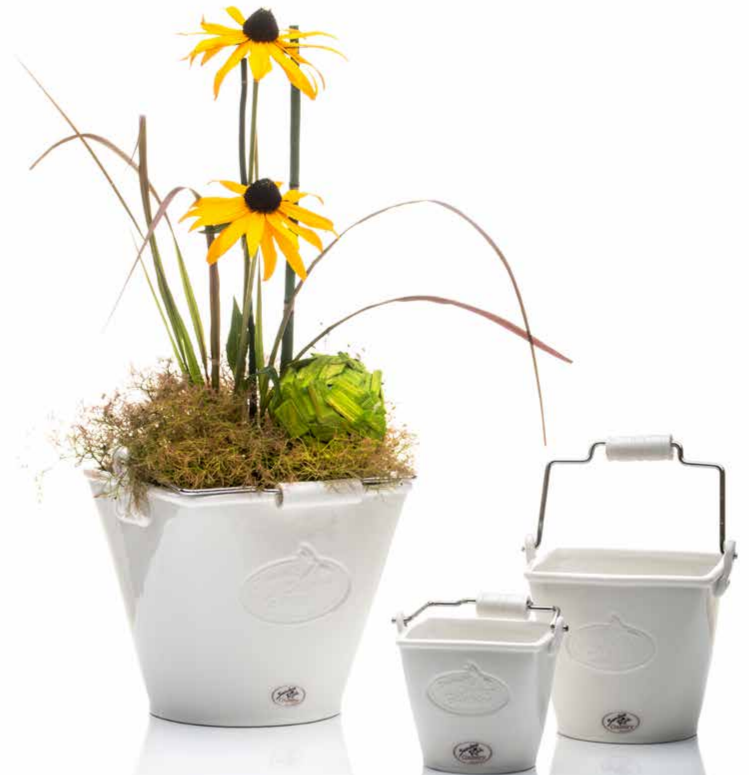
Sandra's SECRET GARDEN - porcelain