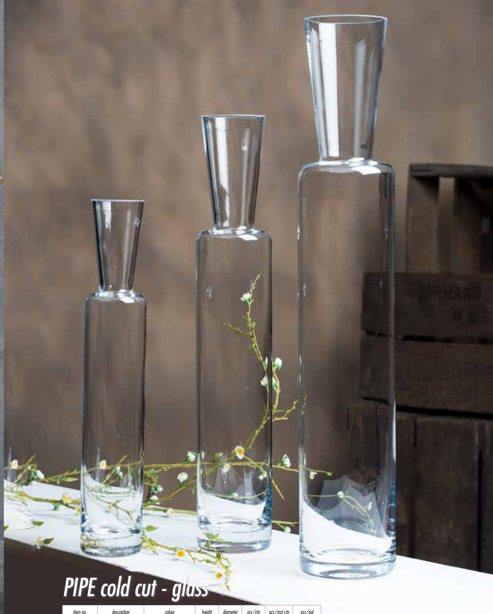
PIPE cold cut - glass