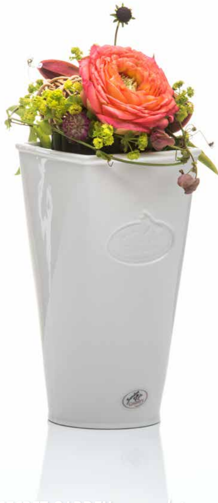
Sandra's SECRET GARDEN - porcelain