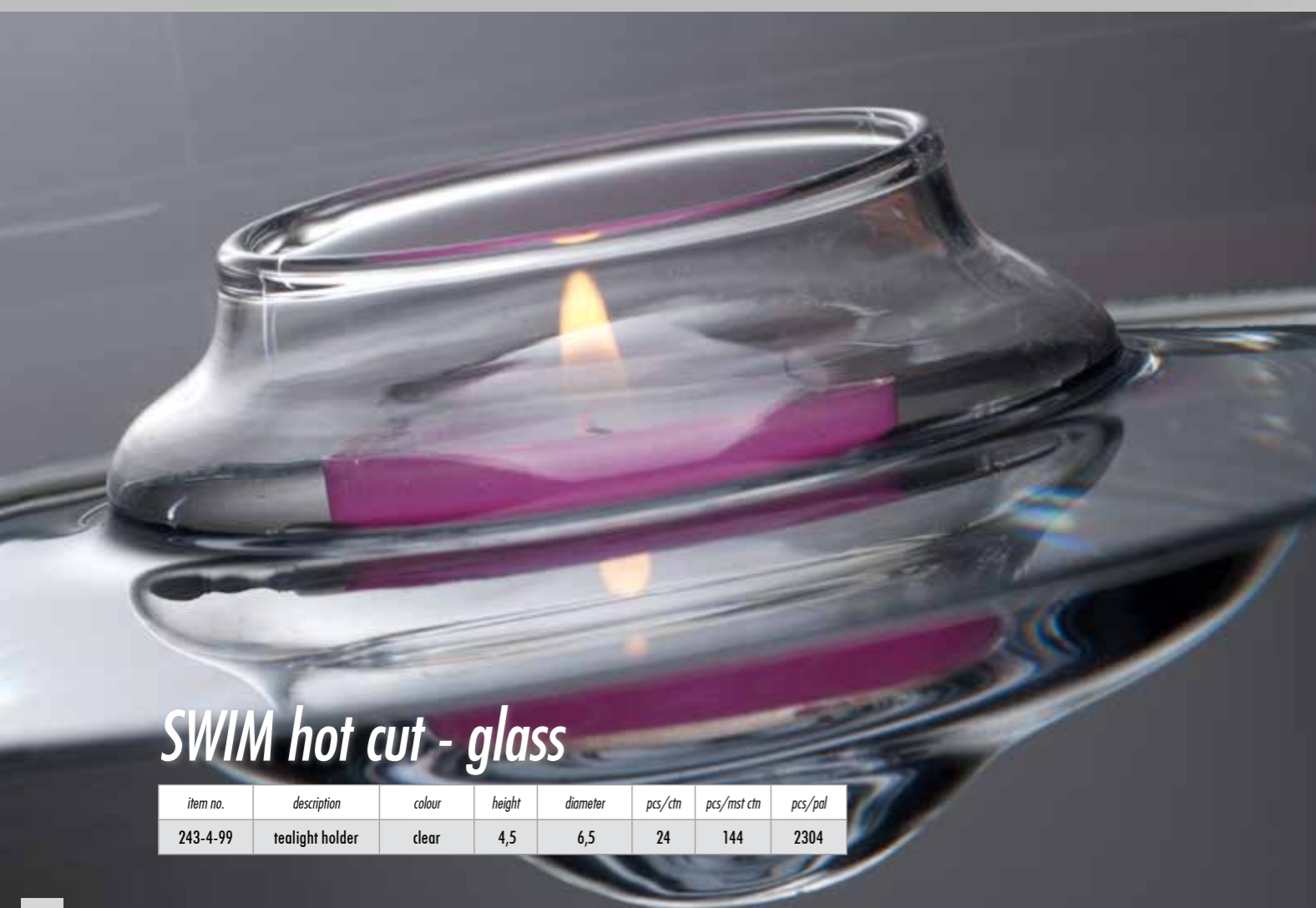
SWIM hot cut - glass