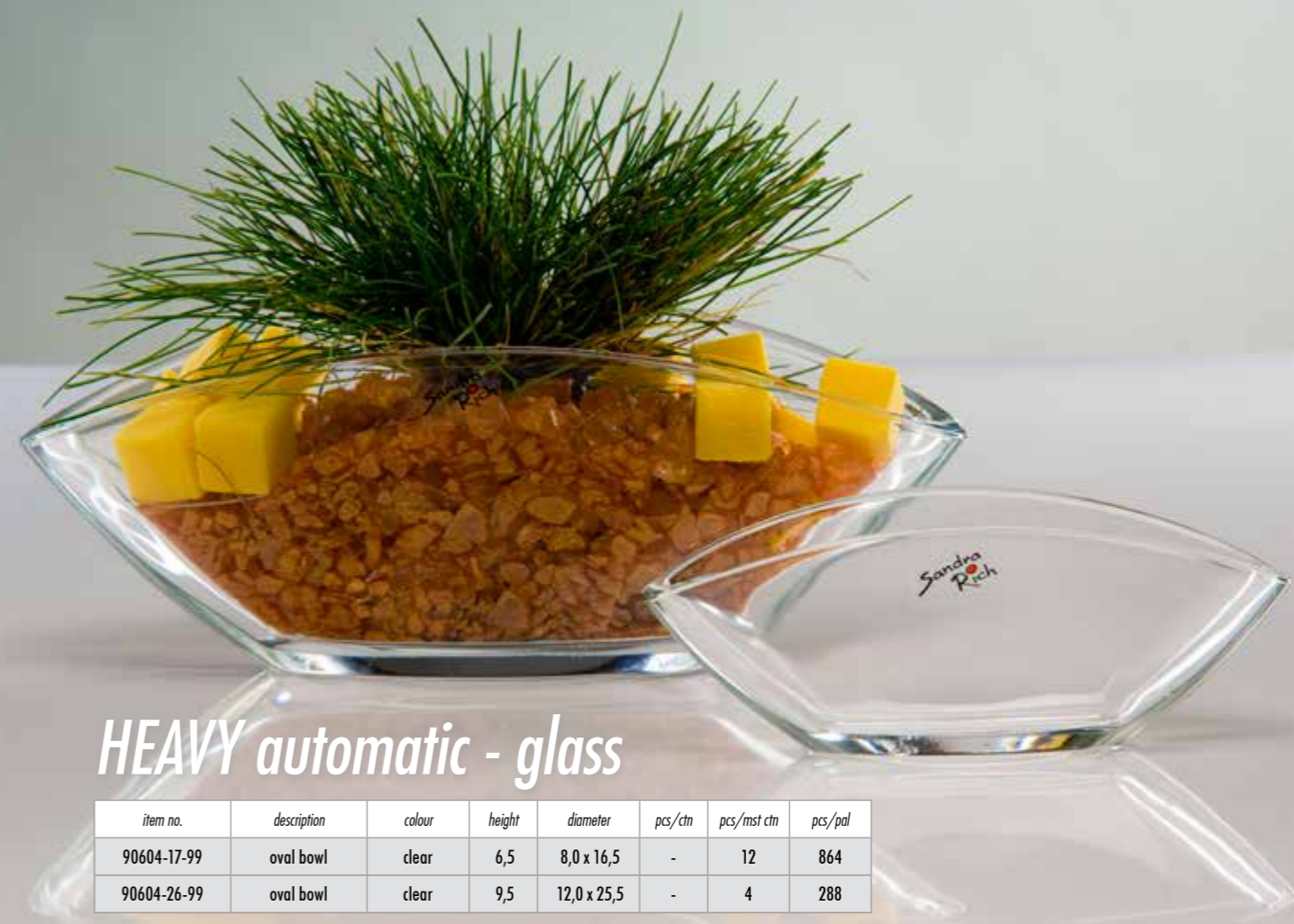
HEAVY automatic - glass