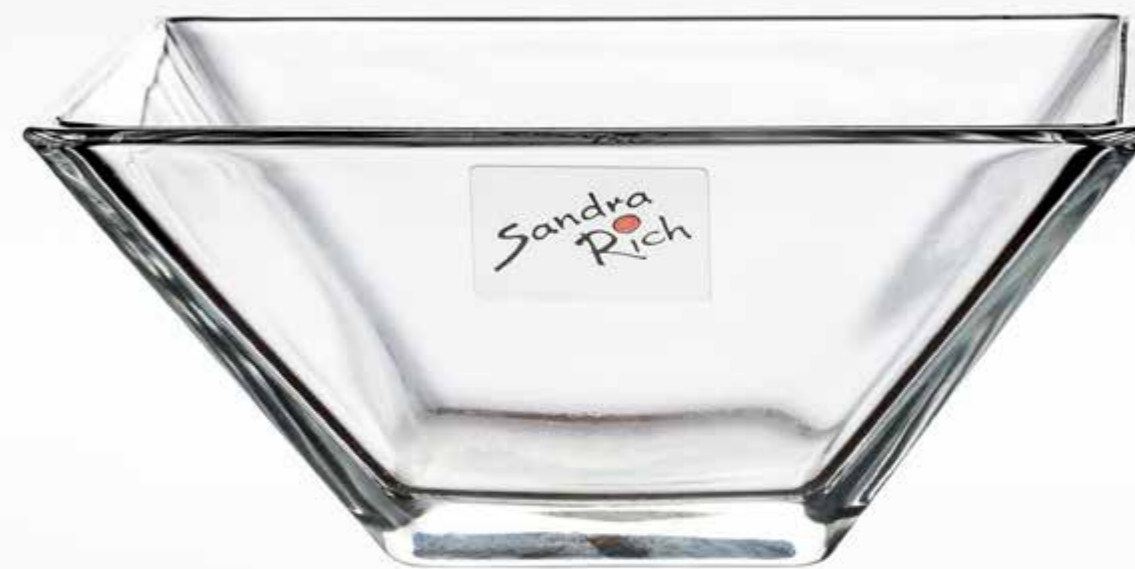
AUTOMATIC - glass