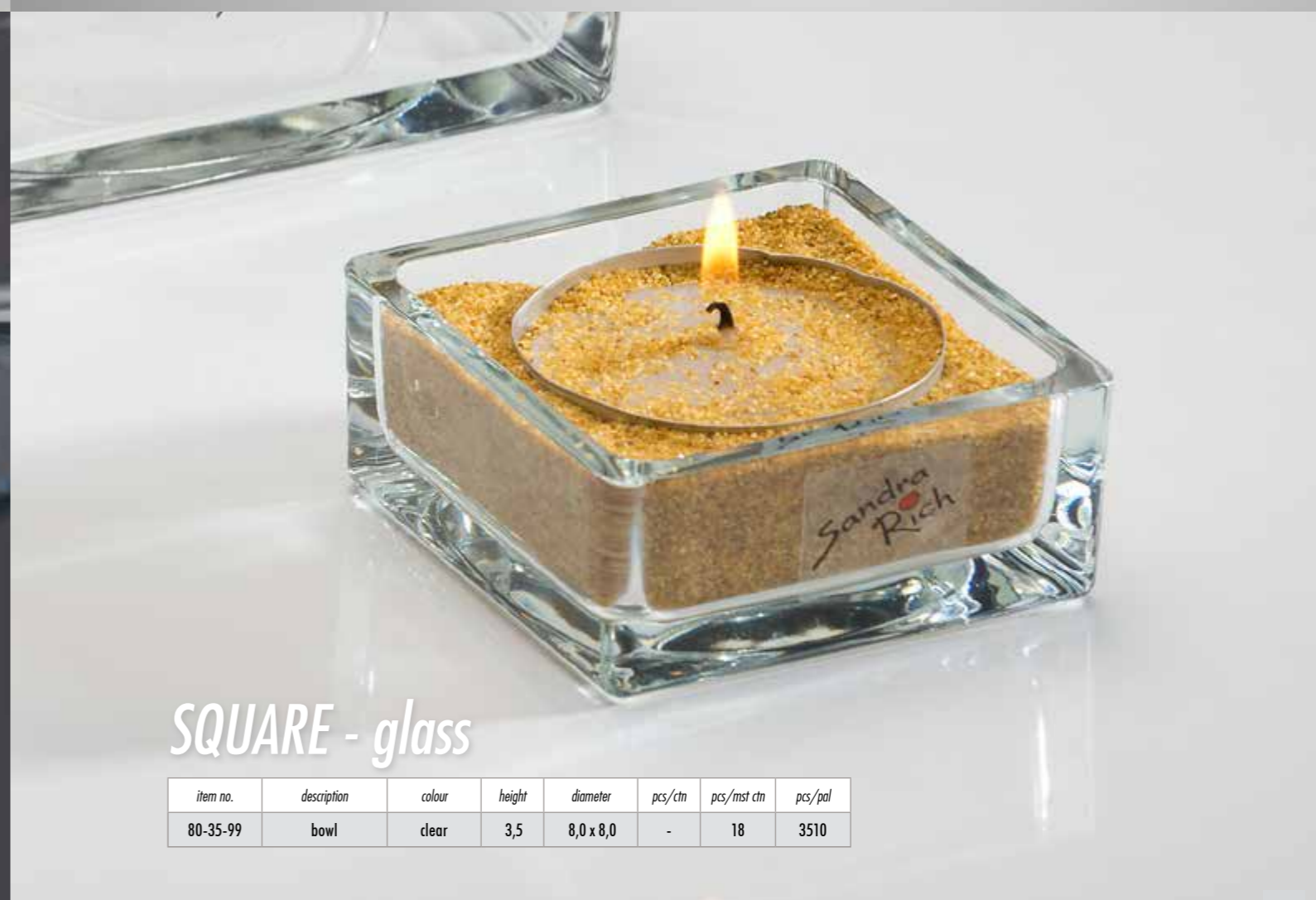
SQUARE - glass