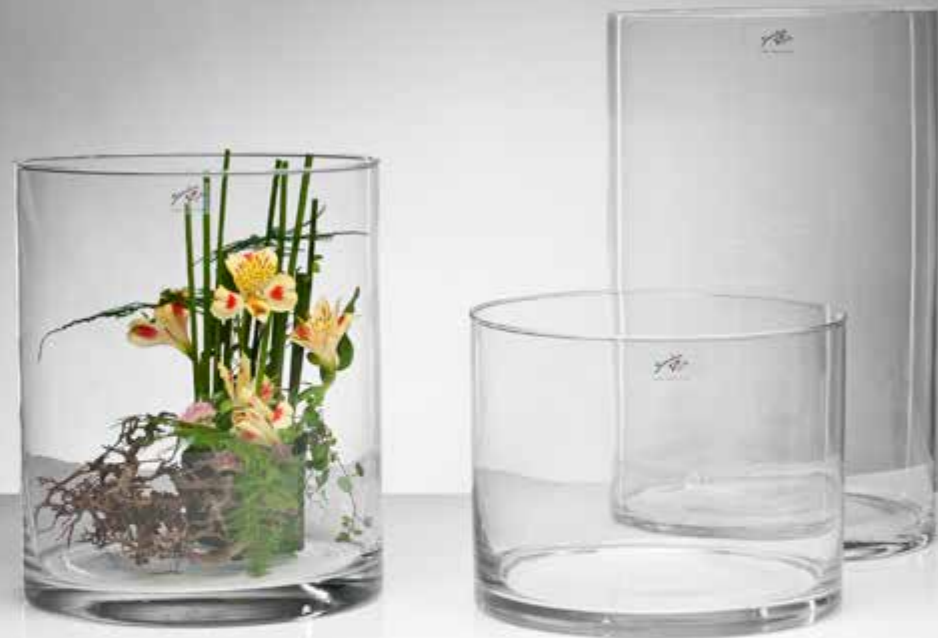
CYLI hot cut - glass