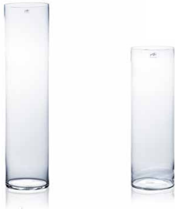
CYLI hot cut - glass