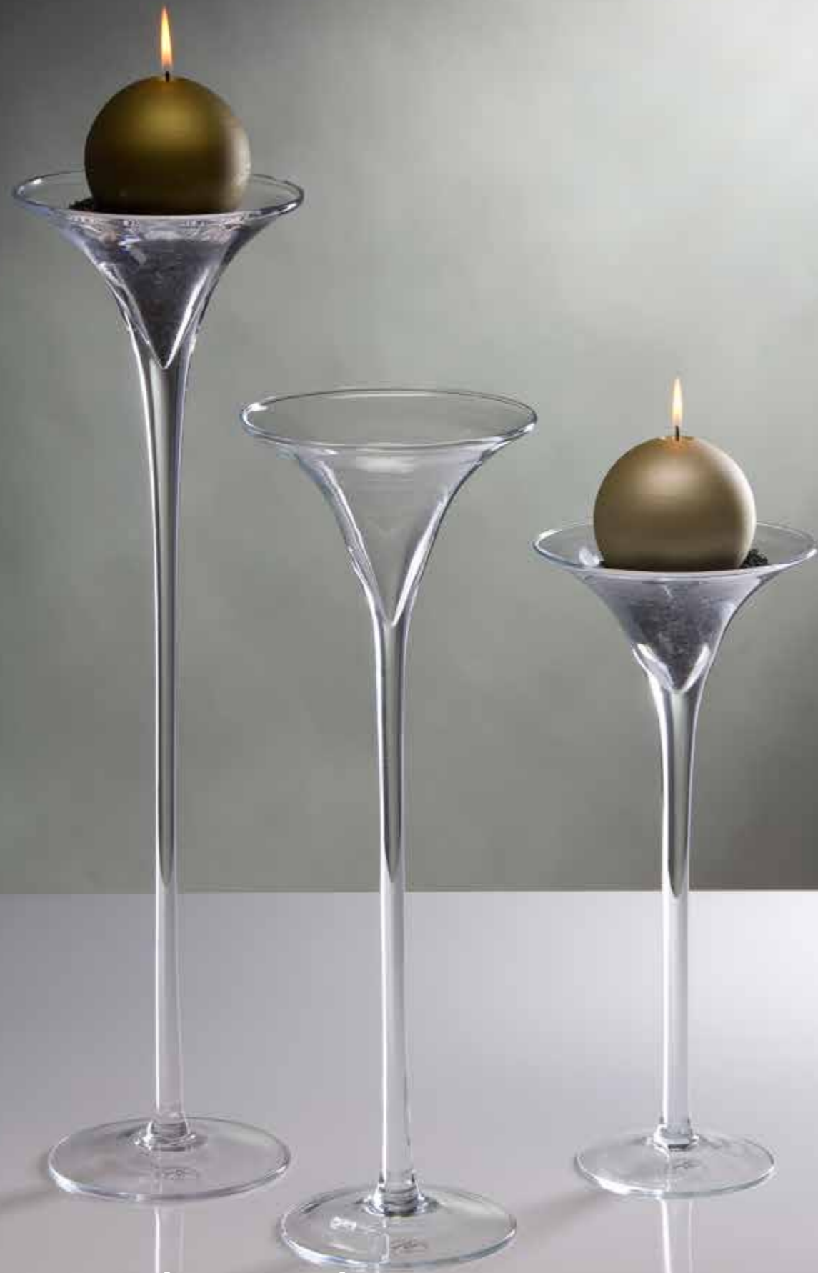
GLIMMER hot cut - glass