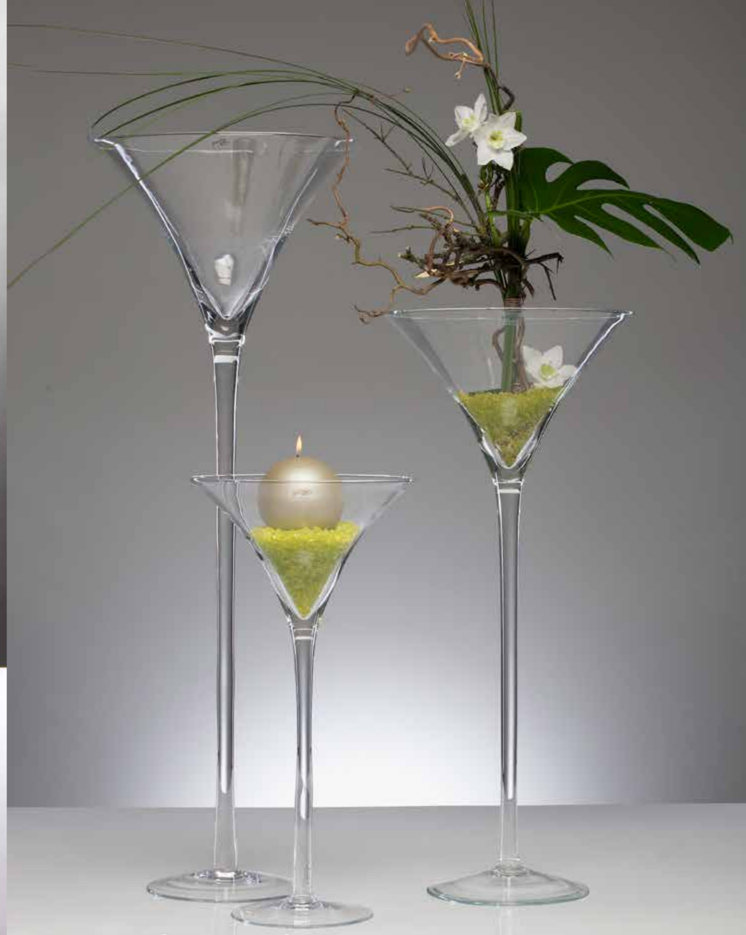
XXL hot cut - glass