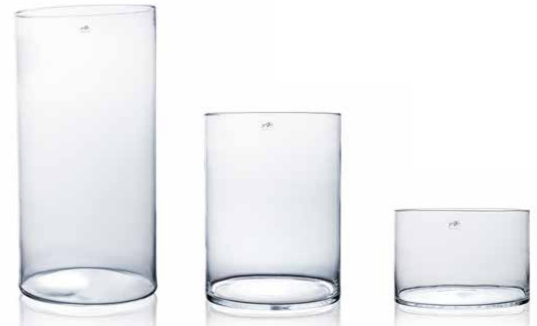
XXL CYLI hot cut - glass