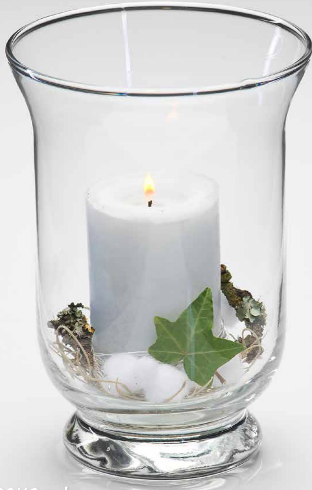
PROMO - glass