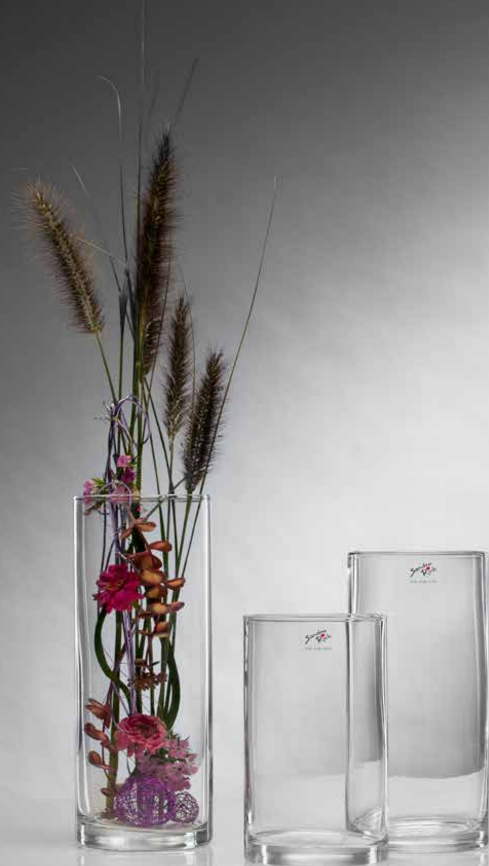
CYLI hot cut - glass