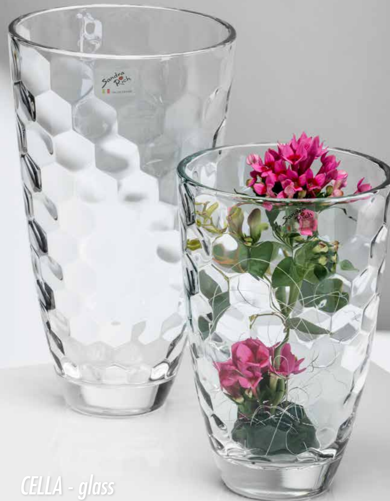
CELLA - glass