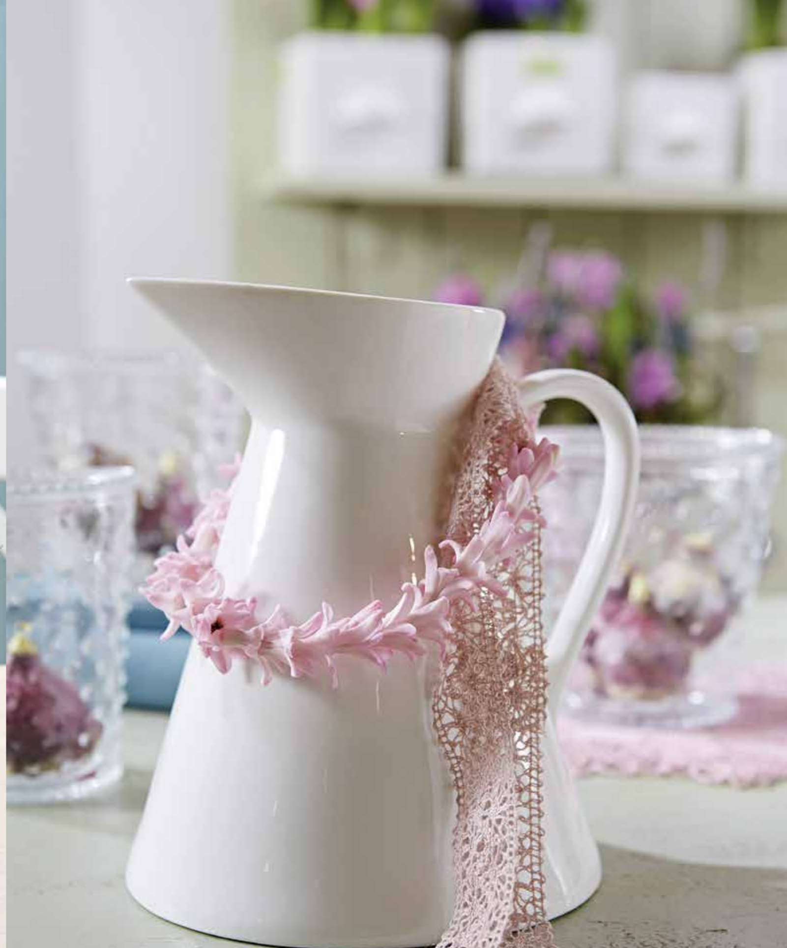
Sandra's SECRET GARDEN - porcelain